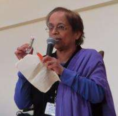
Jasuben advertising for Mast Bahar mouth freshener