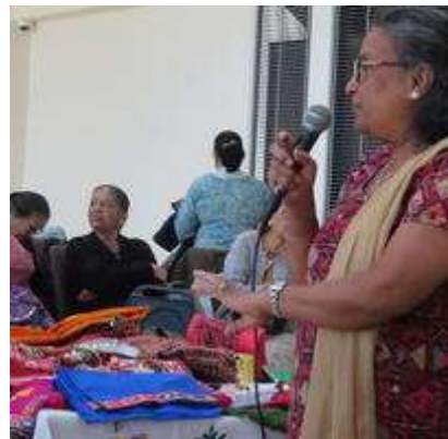
Manjulaben advertising special Chania Choli from Kutch