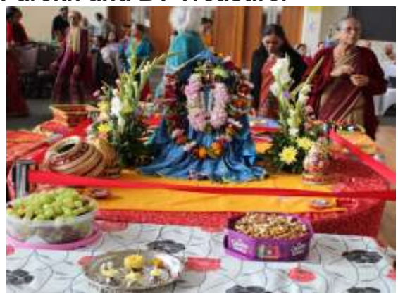
Navratri Decoration colourful attire