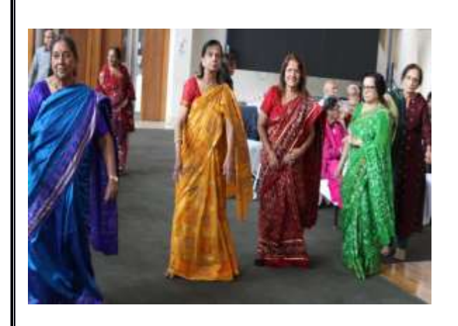
Members doing garbas