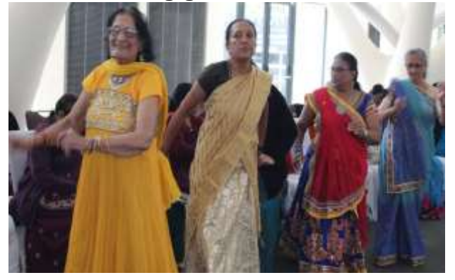
More members playing Garba