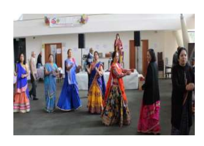
Members playing Garbas in